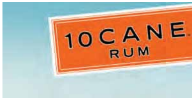
10 CANE RUM